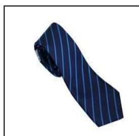
Tie – Elastic for KS1